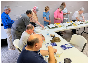
Christmas Cantata listening social

As our busiest season of the year has arrived, we already have begun rehearsals for our Christmas cantata (each Wednesday night from 7:30-8:00). We have about 30 singers and are always looking for more, but you'll need to join us asap. The cantata, titled "Love Was Born A King," will bless your heart with beautiful, powerful songs and numerous solos supported with inspiring visuals on the screens. We will present the cantata at 10:45 a.m. Sunday, Dec. 11. Before rehearsals began, we had a wonderful cantata listening party on Monday, Sept. 12, in the Truth Seekers classroom. It's always wonderful to fellowship with the choir family and let them hear the cantata for the first time.