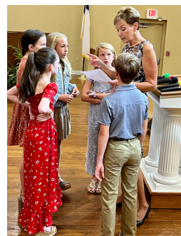
"A Play in a Manger" Christmas Musical rehearsal