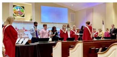
Adult Hand Chime Choir performed Sun. Oct. 18

Cantata practice began on Oct. 21 as an extension of Wednesday night choir practice. We normally have about 35 in that choir, but because of social distancing in the choir loft, that number has been reduced to 20-22.