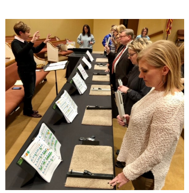
The adults are hard at work on Wed night preparing the Call to Worship

cultivating social enterprises, mobilizing volunteers, and innovating sustainable solutions that shatter stigmas and limitations for women and girls. "Together, we're creating a world with dignity, health, and opportunity for all."