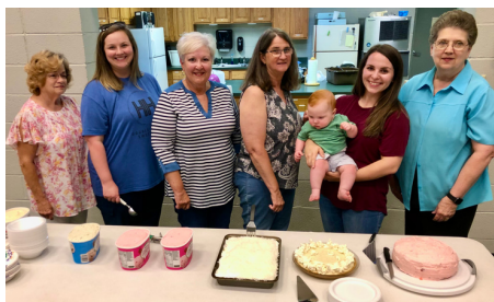
Adult Choir Quarterly Birthday Day Social Servers Birthdays